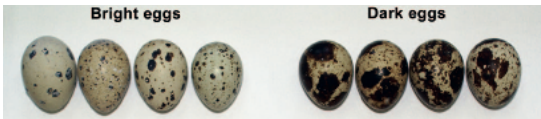
Figure 1. Examples of different spotted (pigmented) patterns on bright and dark quail eggs (Orlowski et al 2017).

Spotted patterns in eggshells have always been thought of as camouflage for potential predators. It is still unclear however, what causes the different patterns found in eggshells and what the evolutionary reason for this variability is (Orlowski et al 2017). Also it has long been unknown what the chemical contents of spots (pigmented area) and unpigmented areas are, although there is increasing novel research (Burger 2008; Orlowski et al 2017). Orlowski et al (2017) shows that the pigments protoporphyrin and biliverdin, which are respectively responsible for red/brown and blue/green colour in Japanese quail ( Coturnix coturnix japonica ) eggshells, bind trace metal ions in a similar fashion as melanin does in bird plumage. Maculated eggshells are also not chemically homogenous: protoporphyrin attracts mainly calcium, magnesium, copper and cadmium, whereas lead is mainly found in presence of biliverdin or in unpigmented area. Orlowski et al (2017) distinguish between bright or dark eggs due to coloration (see figure 1).